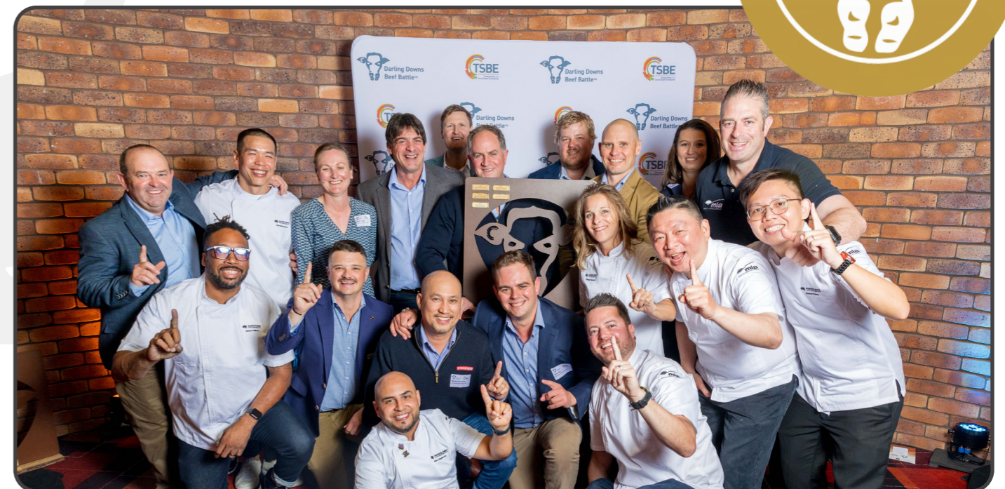
2023 WINNER STOCKYARD