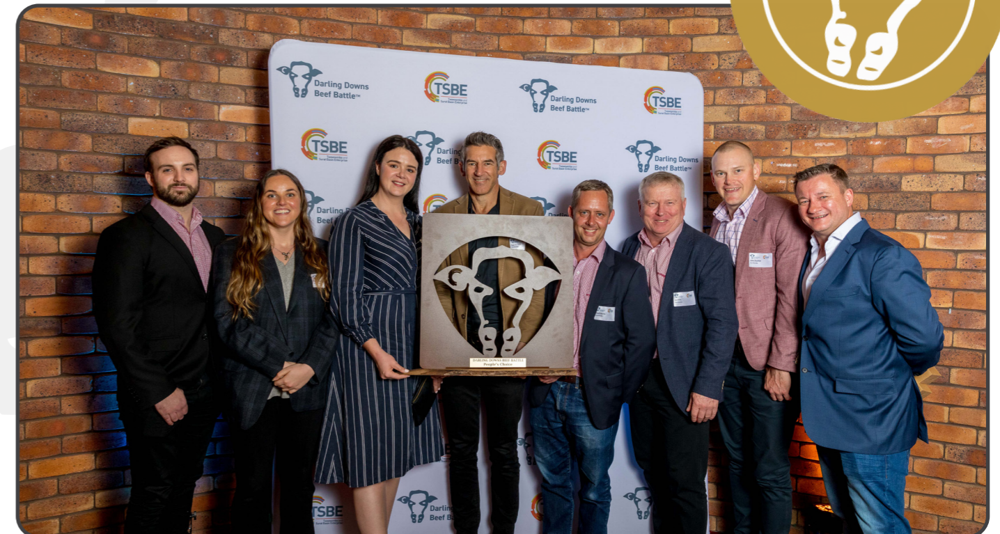
2023 PEOPLE'S CHOICE STANBROKE