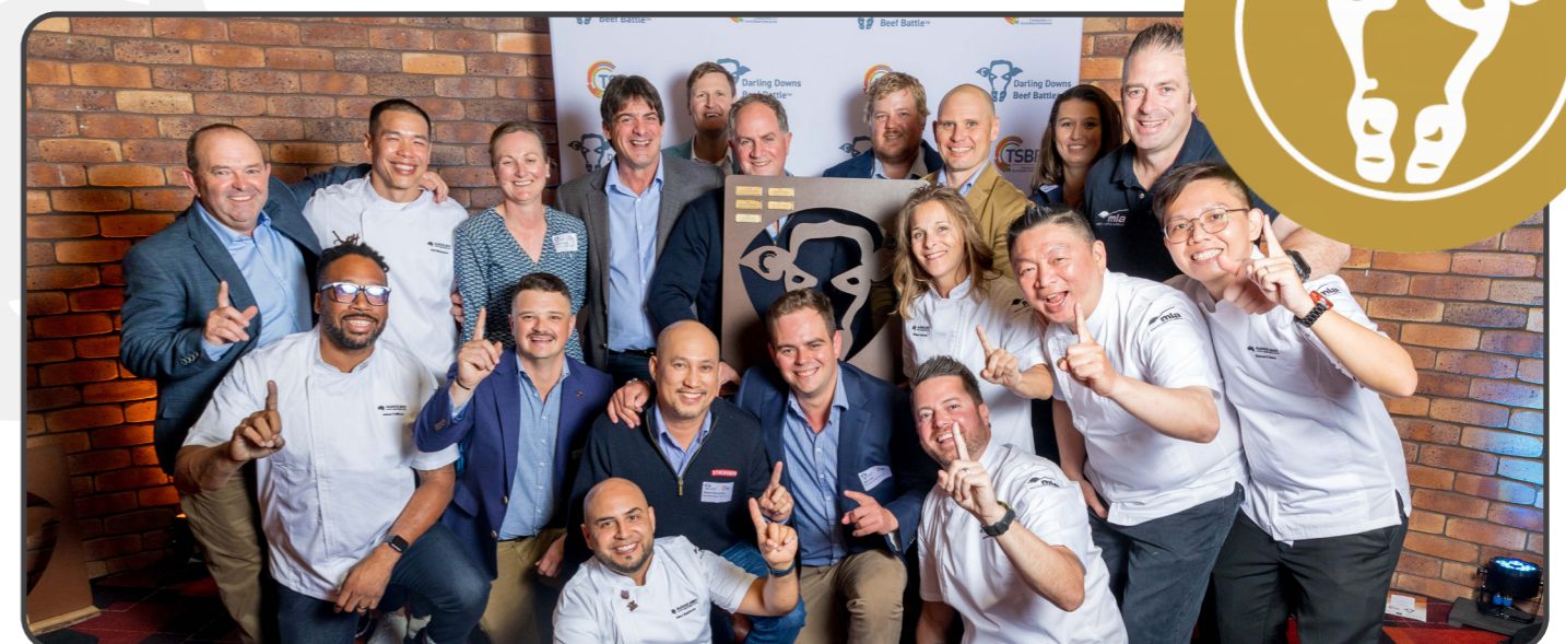
2023 WINNER STOCKYARD