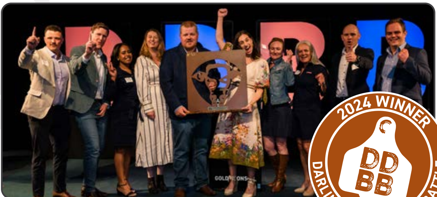
2024 WINNER STOCKYARD