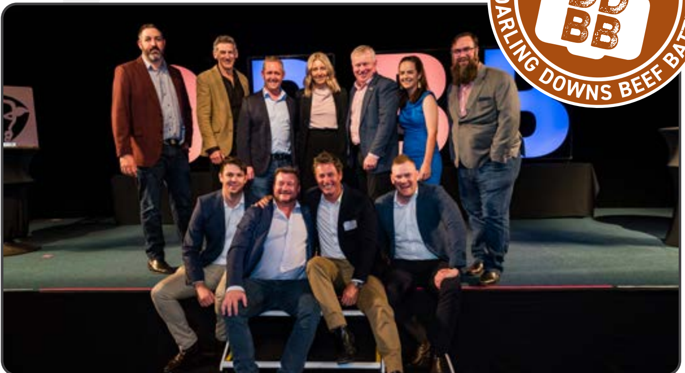
2024 PEOPLE'S CHOICE STANBROKE